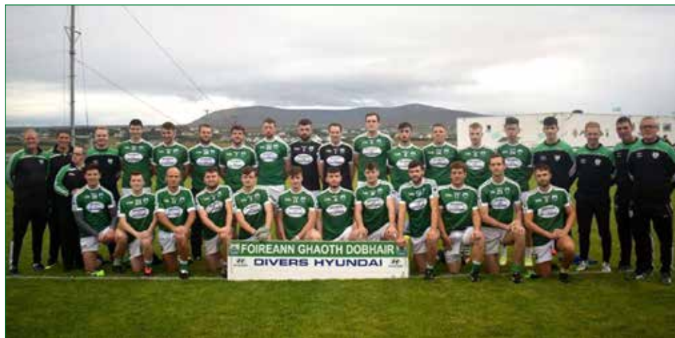
CLG Gaoth Dobhair - Sinsear

Tá súil agam go mbeidh cluiche bríomhar, spórtúil again, go mbainfidh sibh uilig sluit as agus go dté sibh slán abhaile.