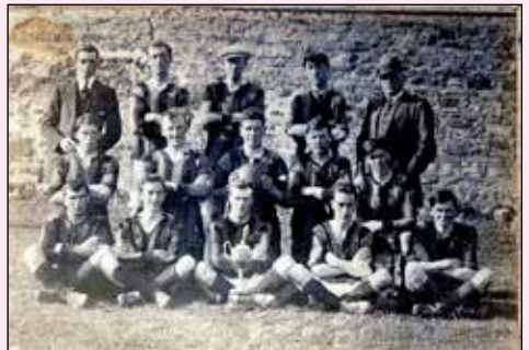
St Patrick's Bundoran, County Champions 1919 / 1920